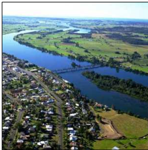
City of Taree & the Manning River

Preparation of a Rezoning Manual for Greater Taree City Council, which reflects all of the most recent advice from the NSW Department of Planning.