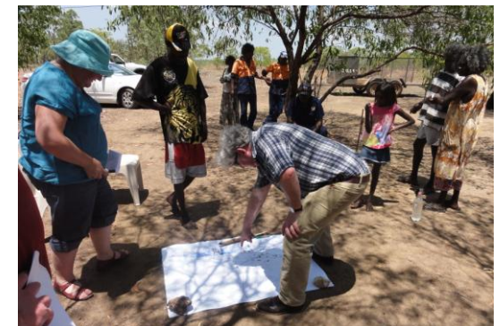
Community meeting to discuss the Community Plan in October 2010